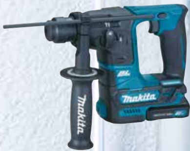
with Side grip assembly and Depth gauge