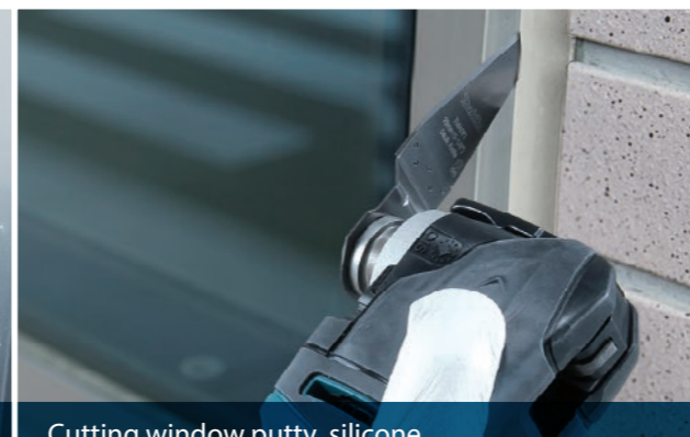
Cutting window putty, silicone