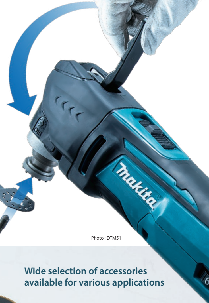
Photo : DTM51

Compatible with all OIS accessories (Oscillating Interface System)