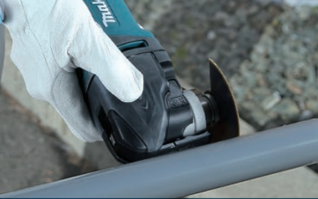
Cutting PVC, FRP pipes