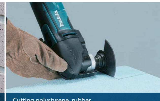
Cutting polystyrene, rubber