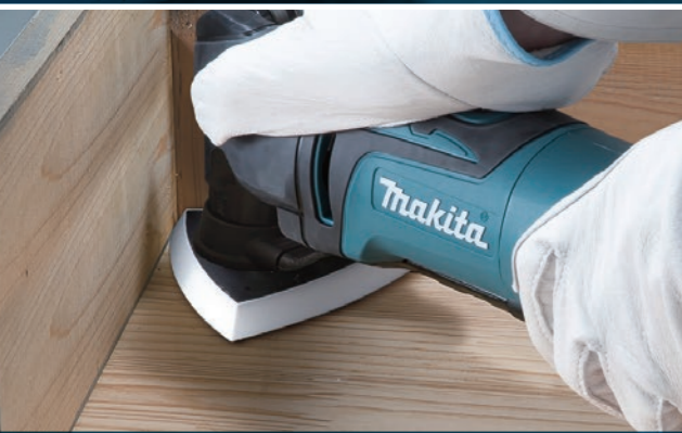
Sanding and polishing various materials