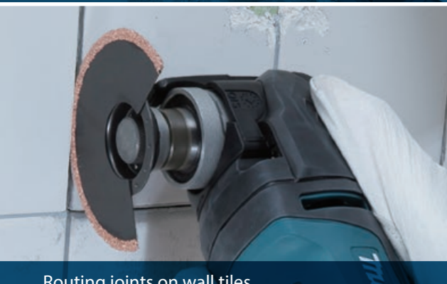
Routing joints on wall tiles