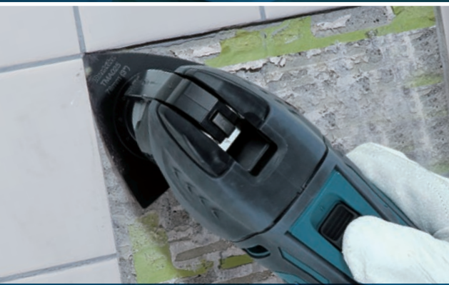
Removing mortar, tile adhesive