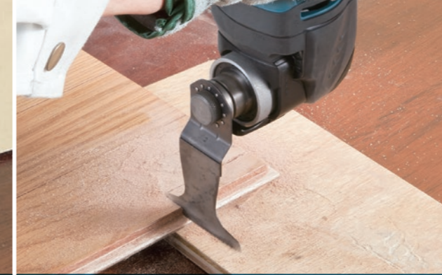
Wood plunge cutting