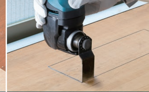
Deep plunge cutting