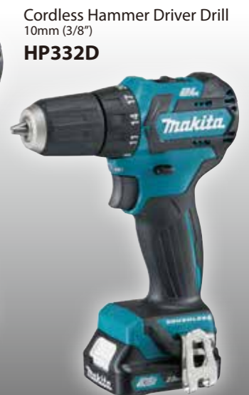
Cordless Hammer Driver Drill 10mm (3/8") HP332D