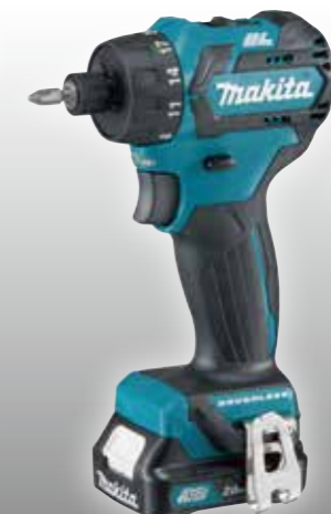
Cordless Driver Drill 10mm (3/8") DF032D