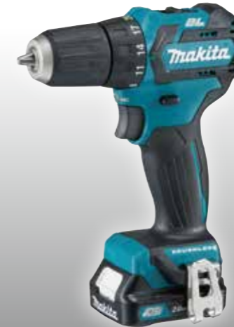
Cordless Driver Drill 10mm (3/8") DF332D