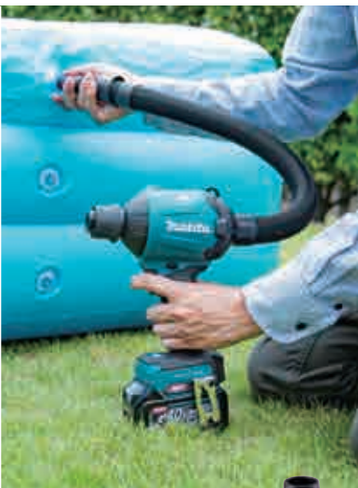
Rubber attachment 20-30 set Part No. 191X25-0 For deflation large play pools and inflatable beds etc.*1