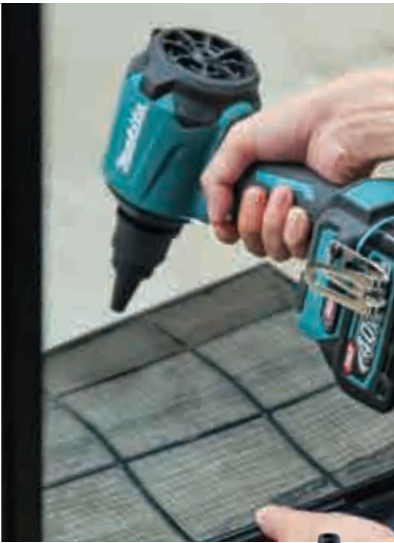
Nozzle 7 set Part No. 191X13-7 For filter cleaning