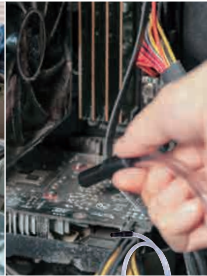
Flexible nozzle complete set Part No. 191X21-8 For blowing dust away from OA equipment or narrow spaces where this machine cannot enter