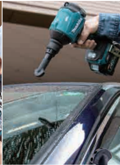
Wide range nozzle set Part No. 191X19-5 For wide range blow-off