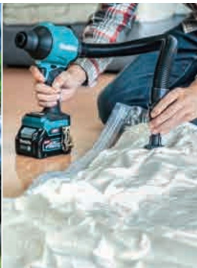
Rubber attachment 65 set Part No. 191X27-6 For deflating futon (bedding) compression bag*1