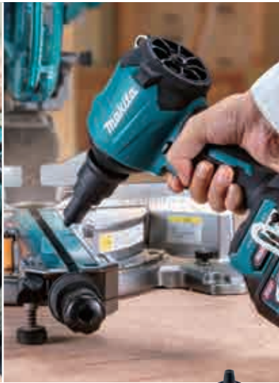
Nozzle 3 set Part No. 191X11-1 For cleaning narrow spaces (can be used like an air spray can)